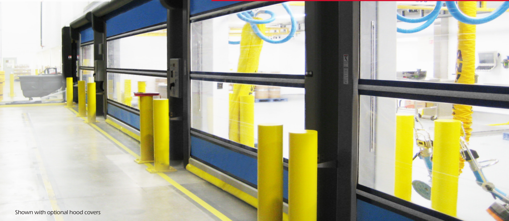
Shown with optional hood covers